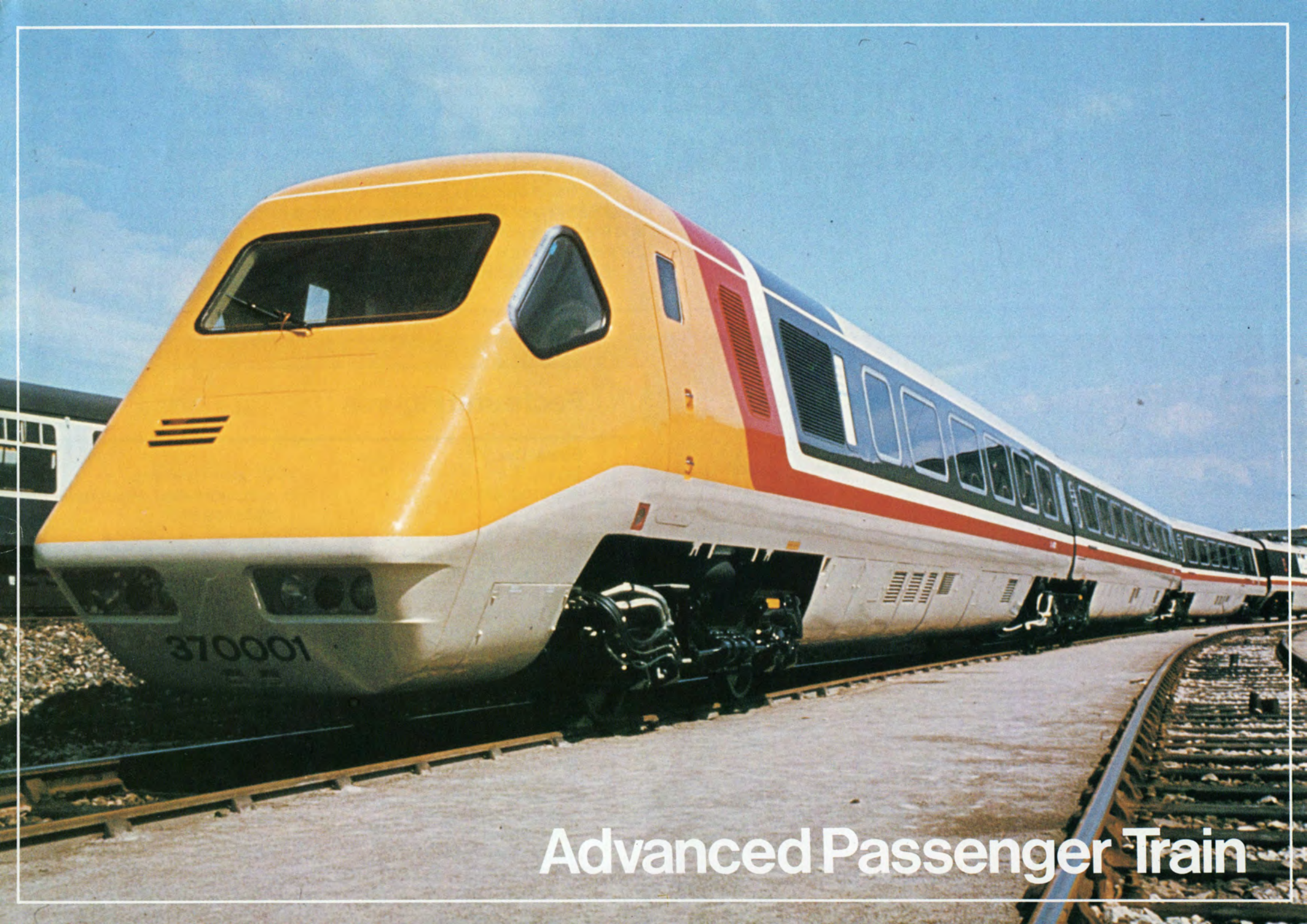
Advanced Passenger Train